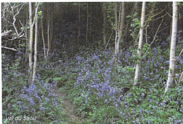
Val du Saou

The small area of grassland through which you approach the Val du Saou is an ideal habitat for Alderney's only reptile, the slow-worm. The field is periodically cut for hay in the late summer and the grass is stacked to create refuges for insects and slow worms.