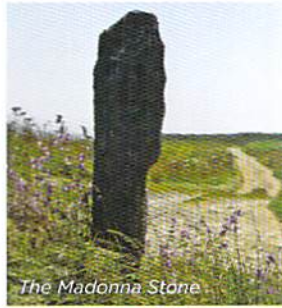
The Madonna Stone

13 Turn left onto High Street and then right, back onto Victoria Street.