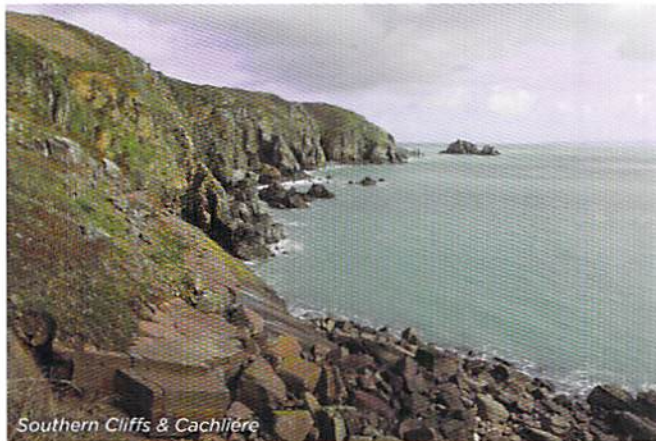
Southern Cliffs & Cachlière