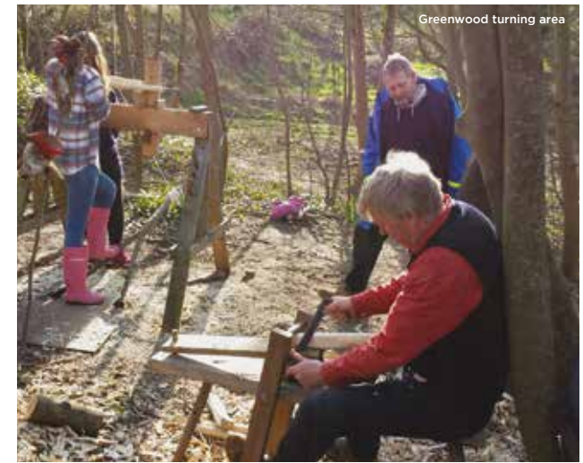
Greenwood turning area