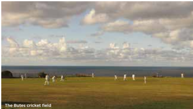
The Butes cricket field

15 Walk straight on, past the Methodist Church on your right, turn left at the foot of the short hill, and then turn right to walk up Victoria Street to return to the Visitor Information Centre.